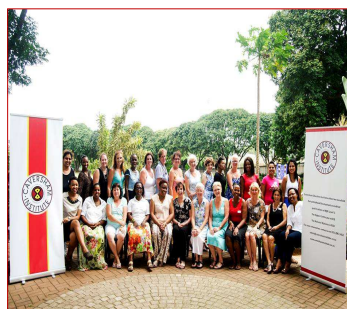
Caversham Education Institute Team

honouring the individual and see the important role that the teacher of young children plays in laying the foundation for life. We believe that she or he can be pivotal in helping our children become well adjusted,