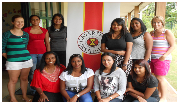
On the left: Ballito Students