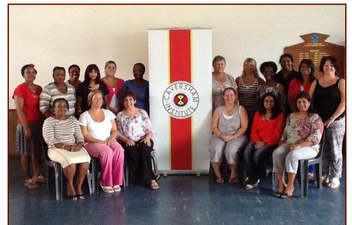
On the right: Port Shepstone Students