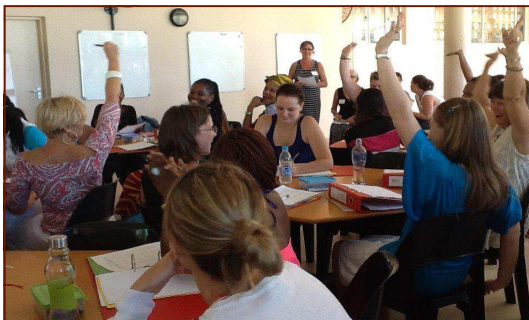
Above: Durban Students

A special THANK YOU goes to all our lecturers and mentees for making our students feel welcome and cared for.